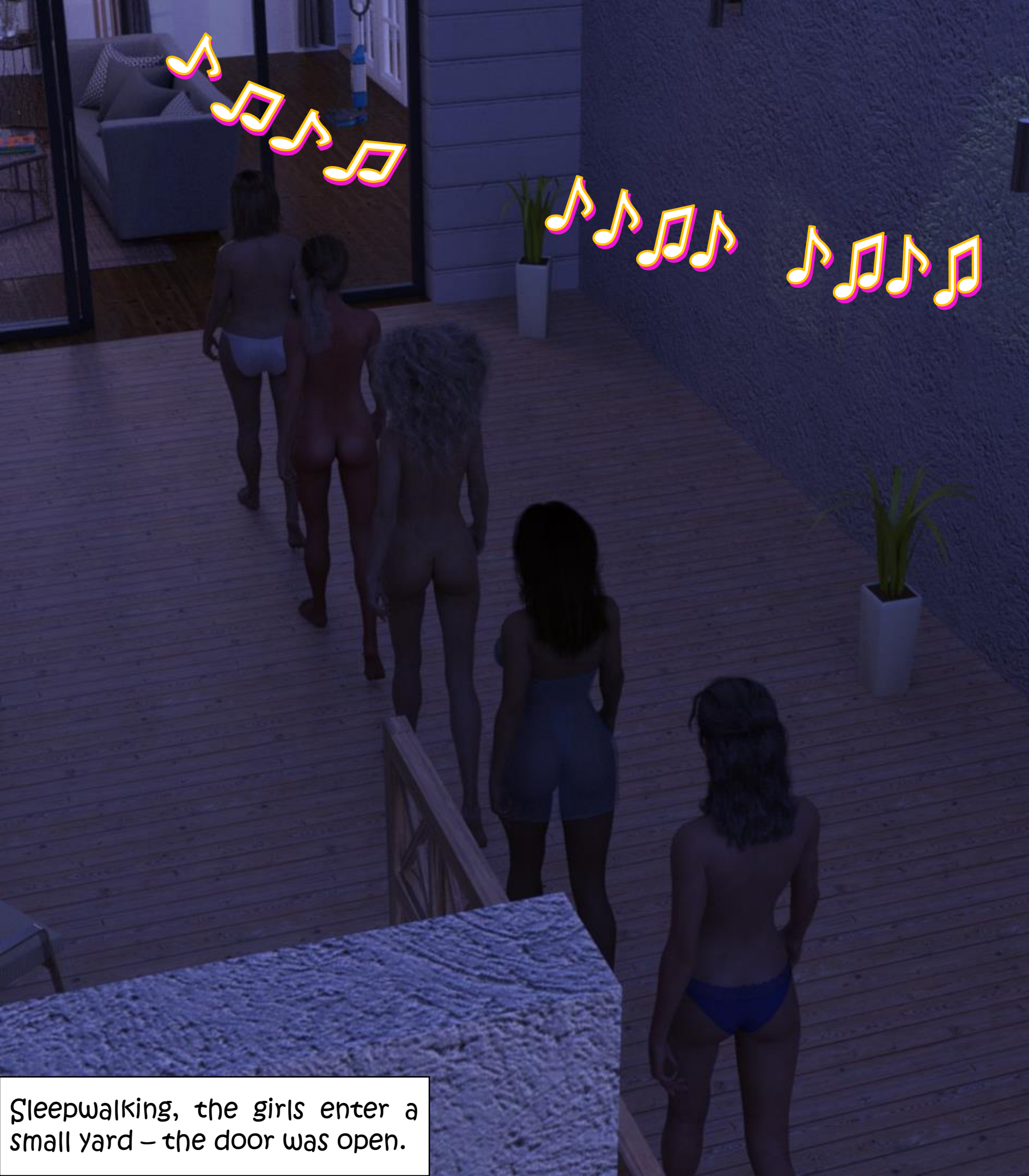
Sleepwalking, the girls enter a small yard – the door was open.