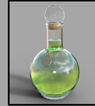
Stamina Potion 199.99$