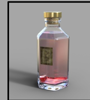
Gender Bender Potion 999.99$