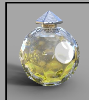
Invisibility potion 999.99$