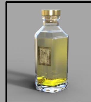
Invisible cock potion 99.99$

Users who have bought this potions also bought these products: