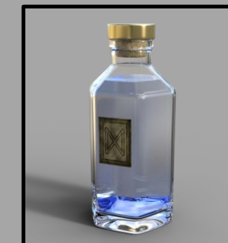
Effect Remover 665.99$