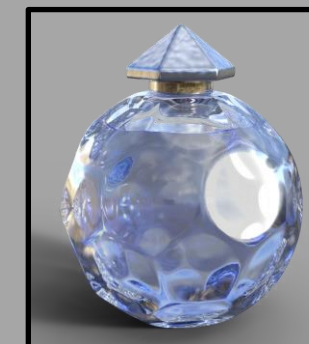
All Clean 2999.99$