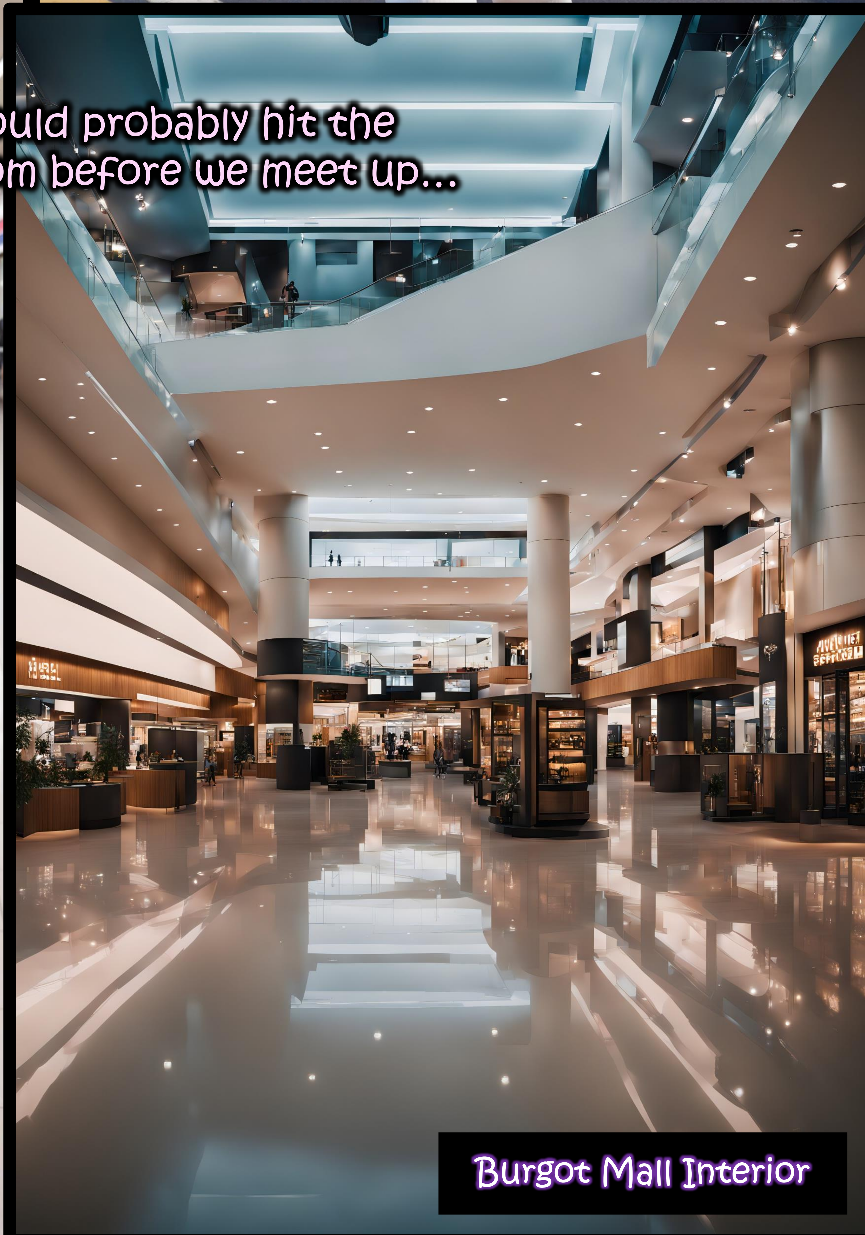
Burgot Mall Interior