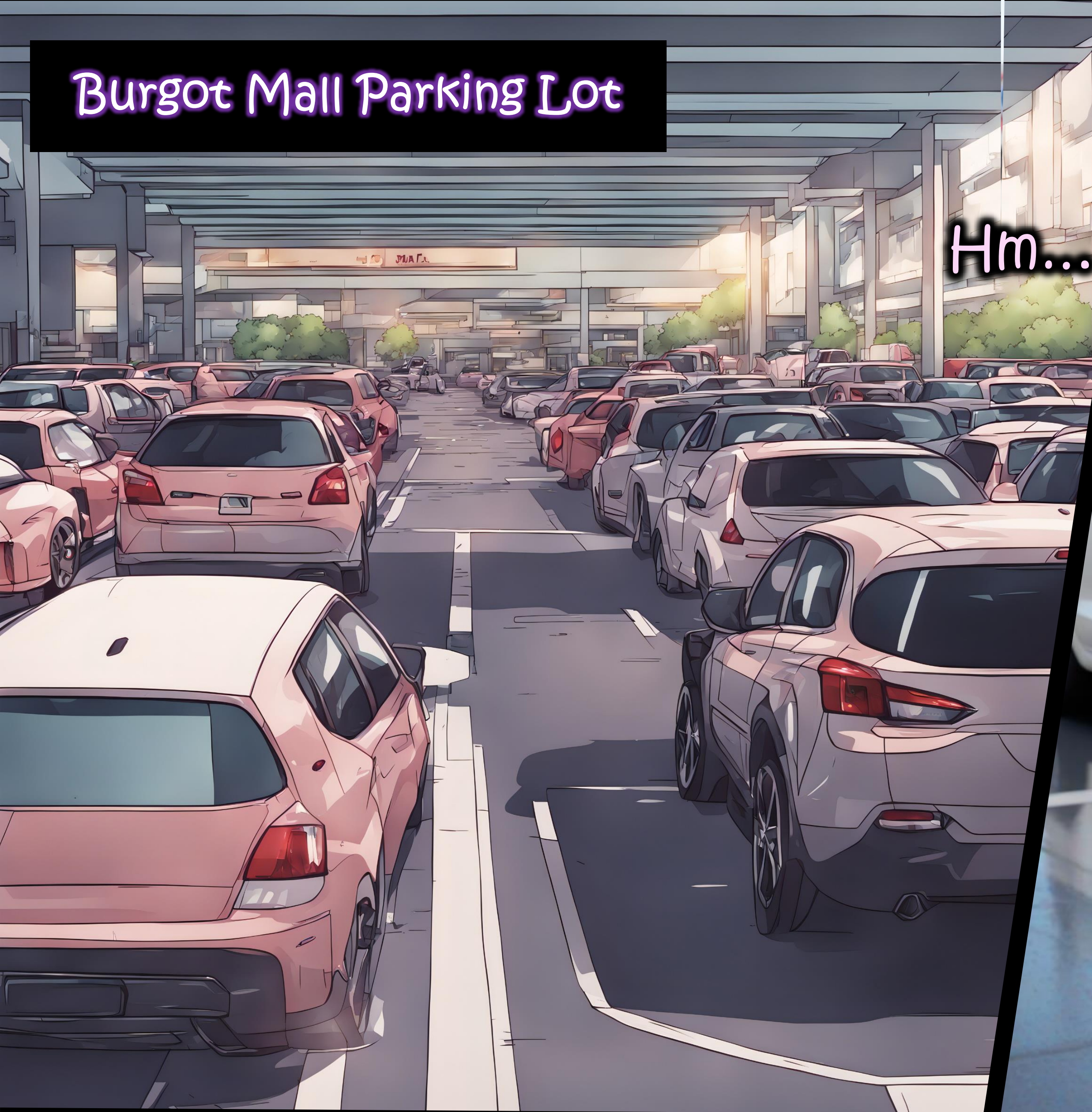
Burgot Mall Parking Lot